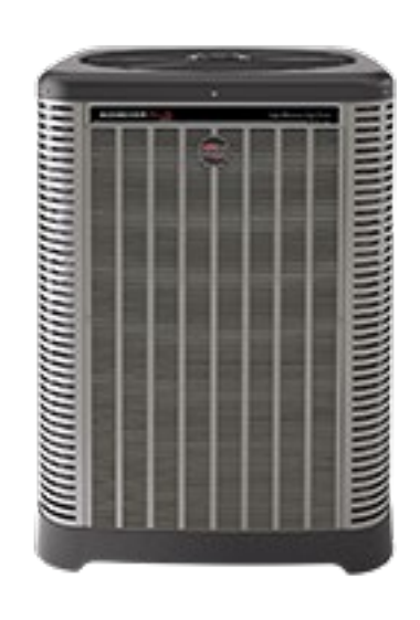
"Typical" residential AC